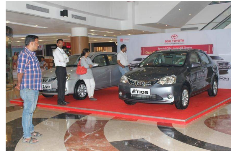
Auto Mall and Auto Mall Logo are the Registered Trade Marks of Relio Quick India Pvt. Ltd.