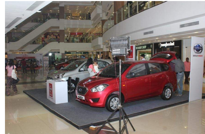
Auto Mall and Auto Mall Logo are the Registered Trade Marks of Relio Quick India Pvt. Ltd.