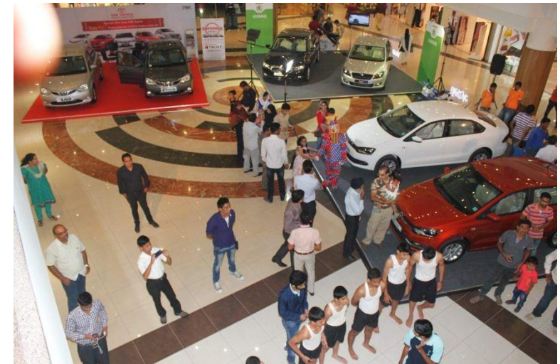
Auto Mall and Auto Mall Logo are the Registered Trade Marks of Relio Quick India Pvt. Ltd.