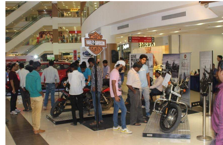
Auto Mall and Auto Mall Logo are the Registered Trade Marks of Relio Quick India Pvt. Ltd.