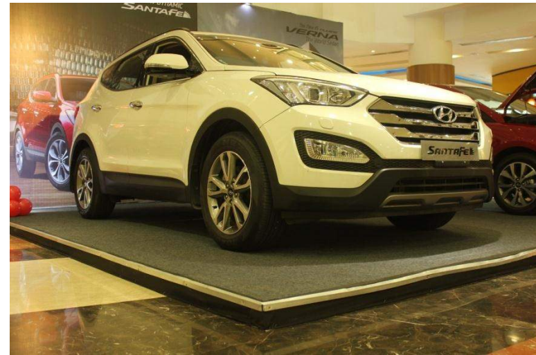
Auto Mall and Auto Mall Logo are the Registered Trade Marks of Relio Quick India Pvt. Ltd.