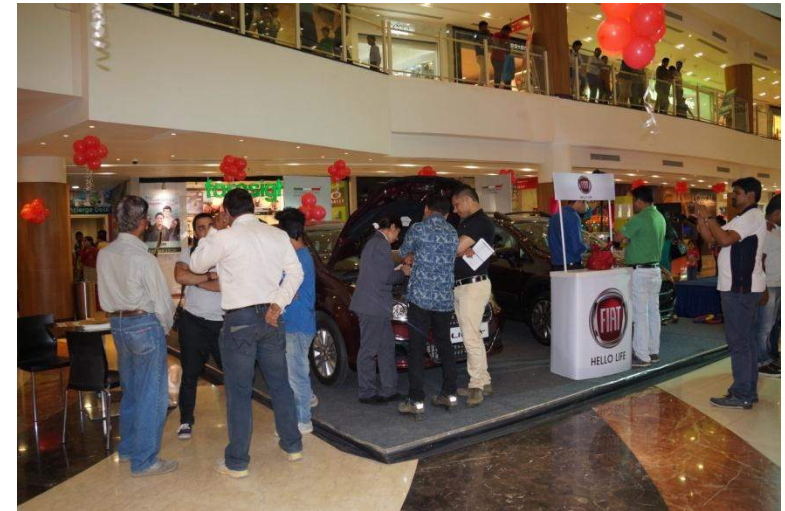
Auto Mall and Auto Mall Logo are the Registered Trade Marks of Relio Quick India Pvt. Ltd.