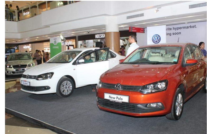
Auto Mall and Auto Mall Logo are the Registered Trade Marks of Relio Quick India Pvt. Ltd.