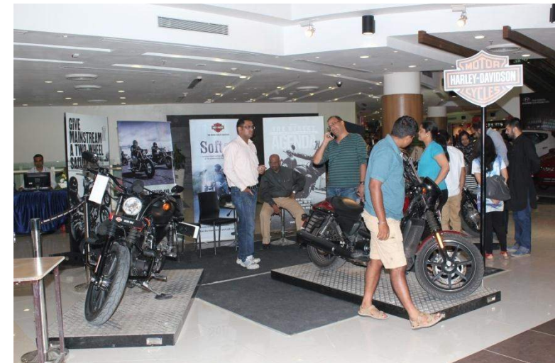
Auto Mall and Auto Mall Logo are the Registered Trade Marks of Relio Quick India Pvt. Ltd.