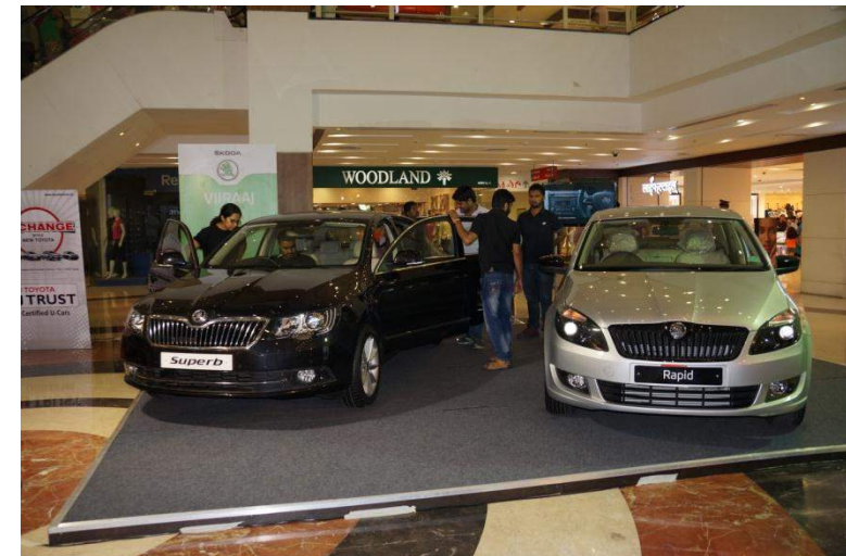
Auto Mall and Auto Mall Logo are the Registered Trade Marks of Relio Quick India Pvt. Ltd.