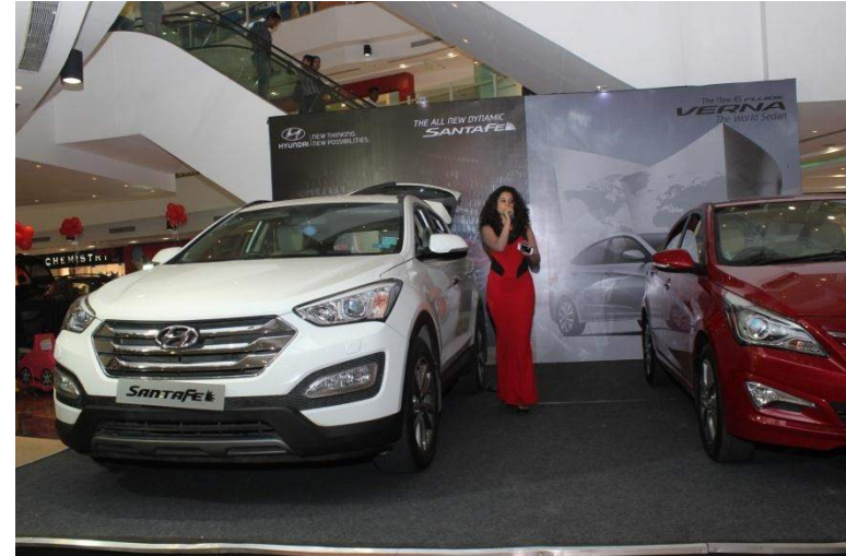
Auto Mall and Auto Mall Logo are the Registered Trade Marks of Relio Quick India Pvt. Ltd.