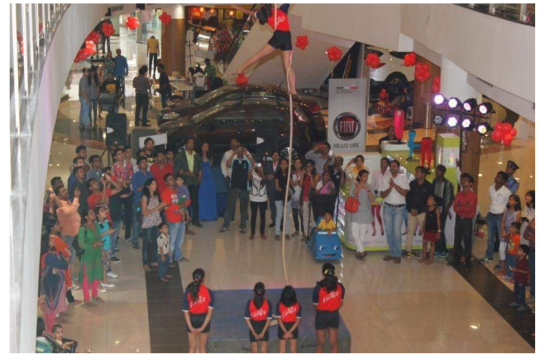
Auto Mall and Auto Mall Logo are the Registered Trade Marks of Relio Quick India Pvt. Ltd.