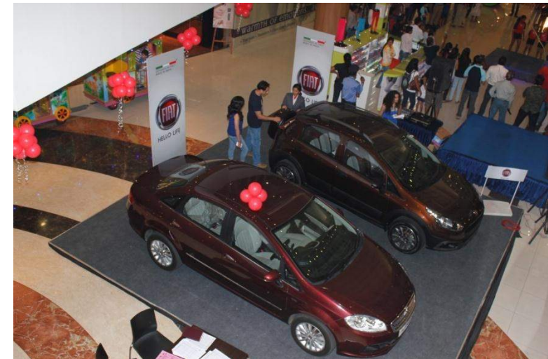
Auto Mall and Auto Mall Logo are the Registered Trade Marks of Relio Quick India Pvt. Ltd.