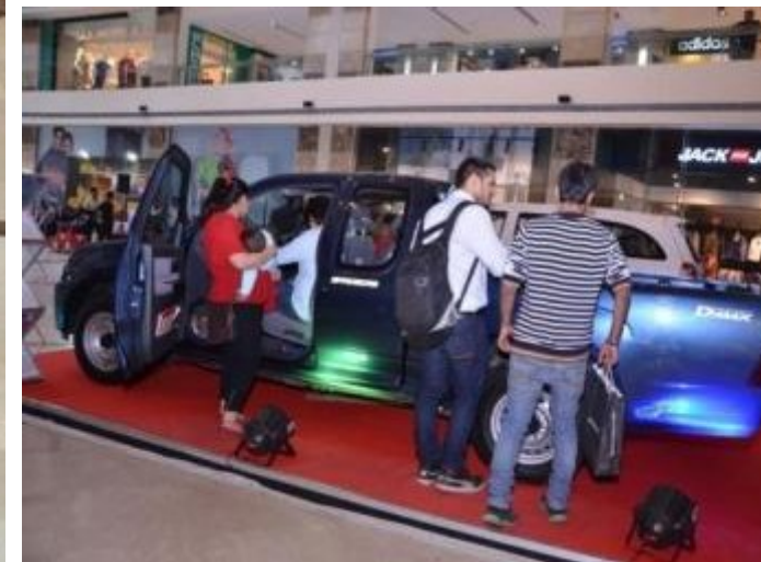
Auto Mall and Auto Mall Logo are the Registered Trade Marks of Relio Quick India