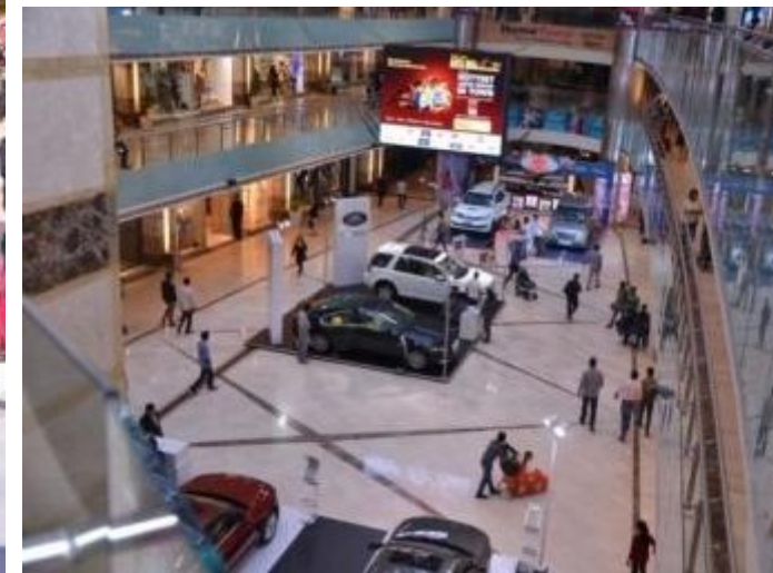
Auto Mall and Auto Mall Logo are the Registered Trade Marks of Relio Quick India