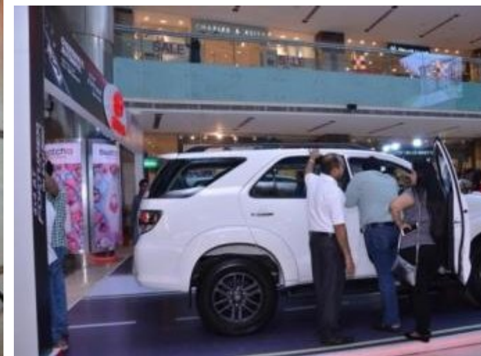
Auto Mall and Auto Mall Logo are the Registered Trade Marks of Relio Quick India