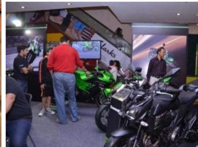
Auto Mall and Auto Mall Logo are the Registered Trade Marks of Relio Quick India