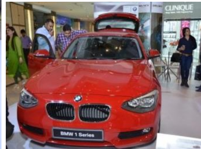
Auto Mall and Auto Mall Logo are the Registered Trade Marks of Relio Quick India