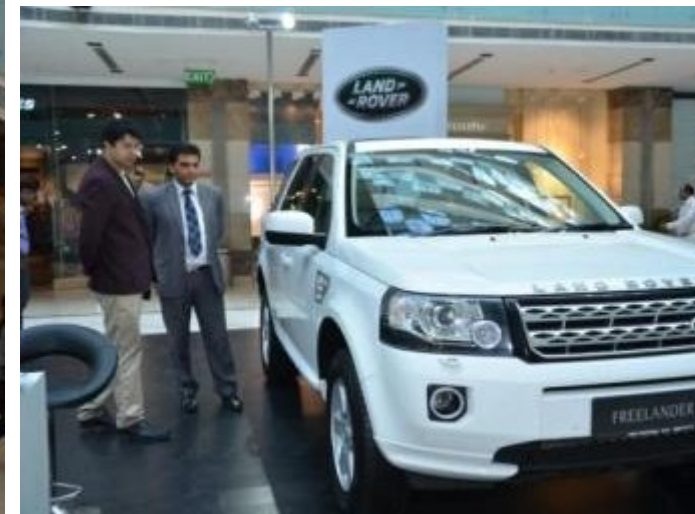
Auto Mall and Auto Mall Logo are the Registered Trade Marks of Relio Quick India