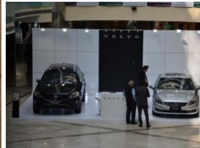
Auto Mall and Auto Mall Logo are the Registered Trade Marks of Relio Quick India