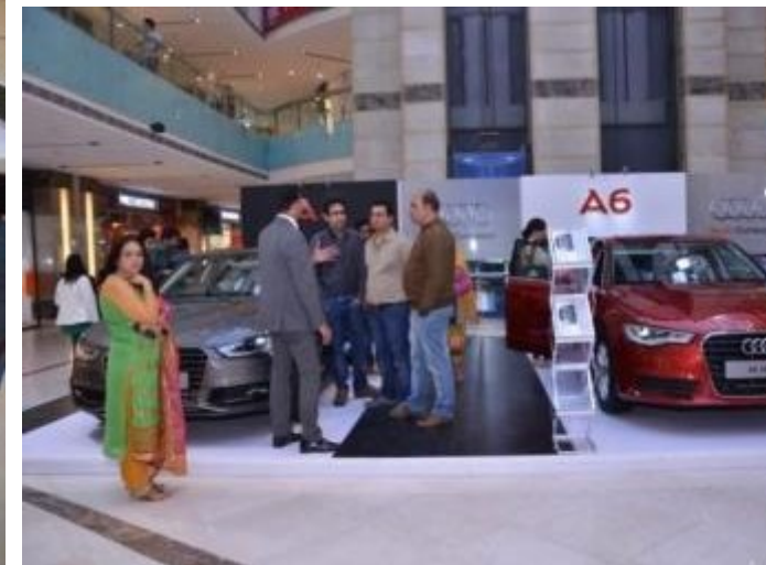
Auto Mall and Auto Mall Logo are the Registered Trade Marks of Relio Quick India