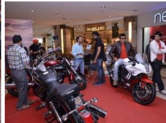
Auto Mall and Auto Mall Logo are the Registered Trade Marks of Relio Quick India