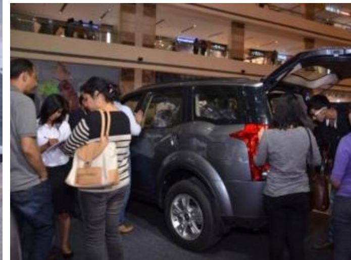
Auto Mall and Auto Mall Logo are the Registered Trade Marks of Relio Quick India