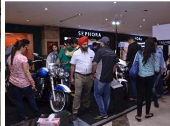
Auto Mall and Auto Mall Logo are the Registered Trade Marks of Relio Quick India