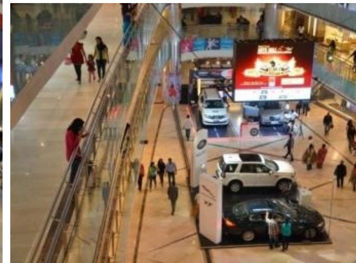
Auto Mall and Auto Mall Logo are the Registered Trade Marks of Relio Quick India